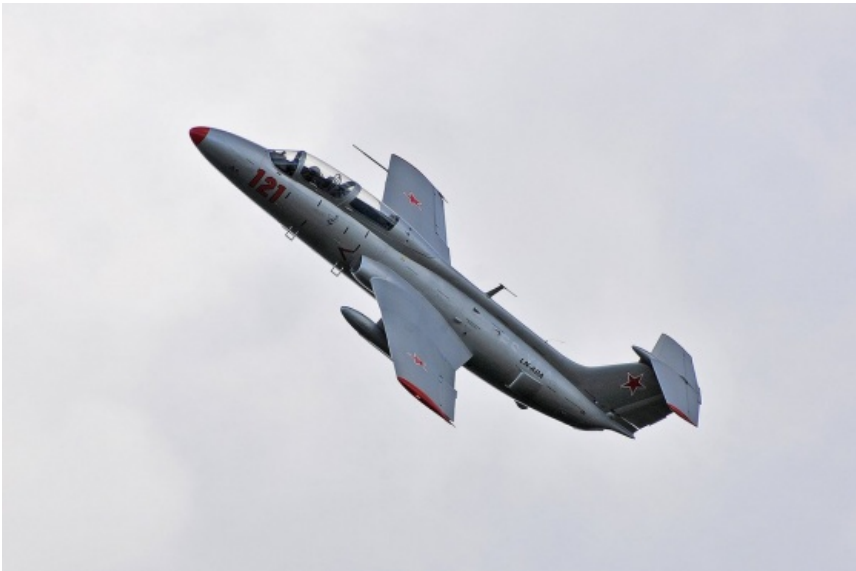
Aero L29 Delfin / LN-ADA

Type: Aero L-29 Delfin Eier: Sameie innen Russian Warbirds of Norway Operatør: Russian Warbirds of Norway Base: Skien lufthavn/Geiteryggen