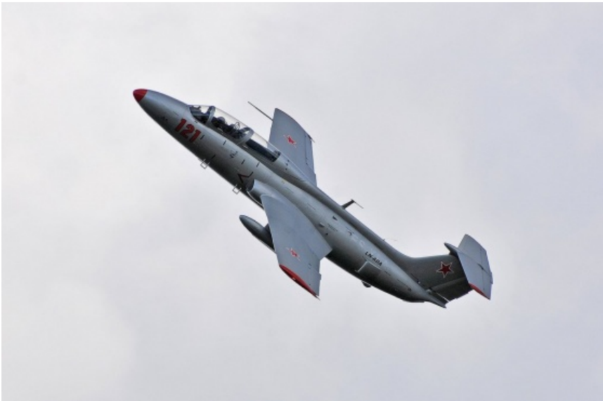
Aero L29 Delfin / LN-ADA

Type: Aero L-29 Delfin Eier: Sameie innen Russian Warbirds of Norway Operatør: Russian Warbirds of Norway Base: Skien lufthavn/Geiteryggen